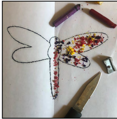
STEPS 3 & 4