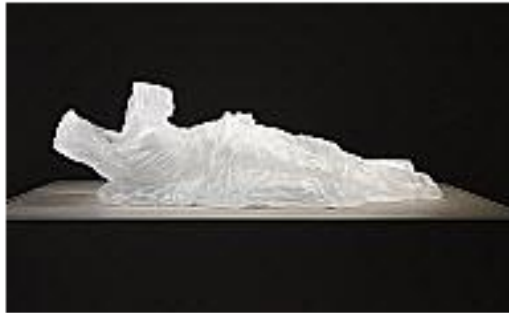
Reclining Dress with Impression and Drapery

Karen Lamonte: http://www.karenlamonte.com/Studio-Artworks-Sculpture/