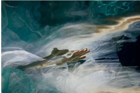
Bliss (from the Submerged Series)