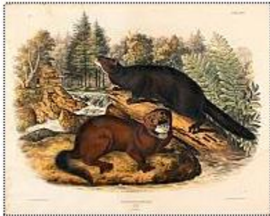
Putorious Vision, Linn (Mink)