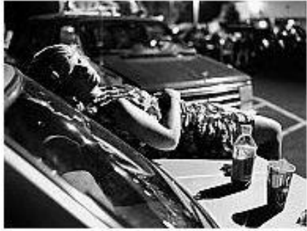
Athens, GA (Girl on a Car)